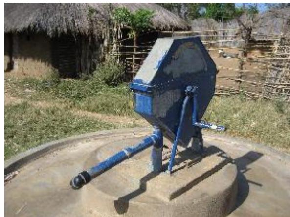
Mozambique. Model with complete cover, (Madagaskar model) 300 installed around 2005. Many problems with maintenance.

Tanzania Here the local organization SHIPO in Njombe introduced the Rope pump in 2006. With support of the Dutch organization Connect International and funds of the Dutch government and Aqua for all, a so called SMART Centre started. This centre demonstrates a range of low cost water technologies like manual drilling hand pumps, water tanks, household filters etc. and trains organizations and local private sector in production, maintenance, business skills etc. The centre organizes trainings for organizations like Winrock/USAID, MSABI, World Vision, Dorcas and others. The result after 10 years is about 35 local companies trained, over 10,000 SHIPO model Rope pumps installed, over 3,000 manual drilled tube wells. Cost