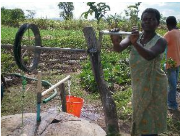
Malawi. Rope pump model no 3 ( Pole model) A family pump used for irrigation

In 2012 the organization ADPP in Itoculo (near Nampula ) trained workshops in the production of the so called SHIPO model. In 2014 the GSB SMART Centre in Bilibiza (north of Pemba) was trained in this model and manual drilling of Tube wells. Now about 100 Rope pumps of this model are in operation and in the Bilibiza are over 90% are functioning.