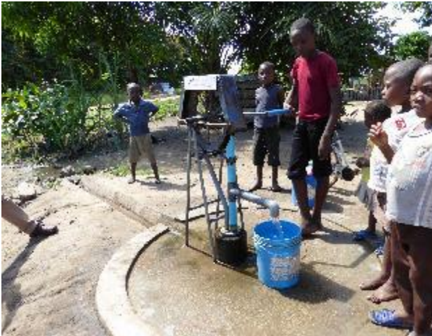
Tanzania. SHIPO Model for communities

reduction for rural water points from 40 to 15US$ per person. More than half of the 10,000 pumps is for Self-supply, sold to families in peri urban areas and increasingly to rural families.