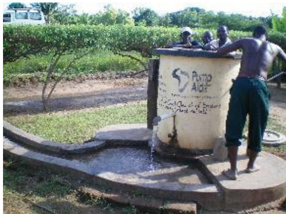
The Elephant Model Rope pump in Malawi

Ghana The first experiences with Rope pumps in Ghana were discouraging. In the year 2000 some 200 pumps were installed. After 1 year 80% of these pumps were defect. Major reasons were errors in construction and installation, lack of follow up and no ownership. These problems caused a bad image and the government did not approve of this pump type. In other parts of Ghana other Rope pump models were installed like the Victoria model produced in Bolgotanga for hand dug wells and the 'Pumping is Life' model on boreholes. Better quality and good community involvement resulted in much better results and most of the new model Rope pumps are working and about 3000 Pumps are now installed. The Rope pumps in northern Ghana were among others supported by Water Aid and the good results of the new pumps slowly improves the image of the Rope pump in Ghana again.