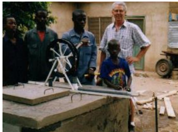
The Victory model, Ghana Bolgotanga