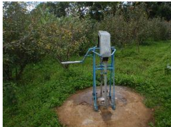
Rope pump model Ethiopia

Malawi Several Rope pumps were introduced around the year 2000 in order to provide an alternative for the Afridev Community hand pump, which is the standard hand pump in Malawi. The Afridev was less popular due to many breakdowns (although this was mainly due to lack of maintenance) and not available spare parts, especially in the more remote areas. However, the Rope pumps also broke down, sometimes several times per month, due obsolete pump designs low quality, the high number of users and lack of maintenance and repair capacity. It was not considered by the users as a good community pump, although repairs were possible. Another disadvantage mentioned was that children found it difficult to pump (caused by too large pump pipe diameter) and sometimes got hurt when the handle blocking system was not functioning (due to lack of quality control). In 2008 over 2000 simple Pole model Rope pumps for irrigation were installed near Blantyre made by the organization DAPP. In 2012 the CCAP SMART