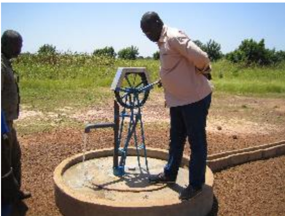
Rope pump Burkina Faso, Winrock in 2012

Ethiopia. Rope pumps were introduced here around 2006 by the Practica foundation and supported by organizations like IDE, JICA and Water Aid. During several years local metal workshops have been trained in production. However the pump became so popular that untrained workshops also started to produce and sell the pumps. By 2012 there were an estimated 10.000 Rope pumps installed but often the pump and or installation was of a poor quality resulting water to leak back in the well and causing recontamination. In 2013 the government of Ethiopia decided to improve and standardize the Rope pumps and is doing this with support from JICA and MetaMeta. A national policy now is to reach the goal of water for all by a large upscaling of Self-supply. The Rope pump is seen as an important tool to reach this goal and in 2014 local governments ordered 10.000 Rope pumps. However most of these pumps are still in stores since the demand for Self-supply was never created. Before this almost all of the first 10.000 pumps were given away (Mekonta 2014).