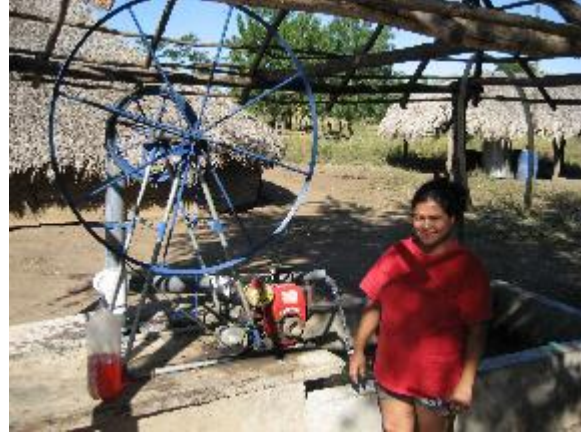
Motor Rope pump Nicaragua