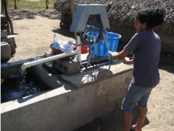
Hand Rope pump Nicaragua