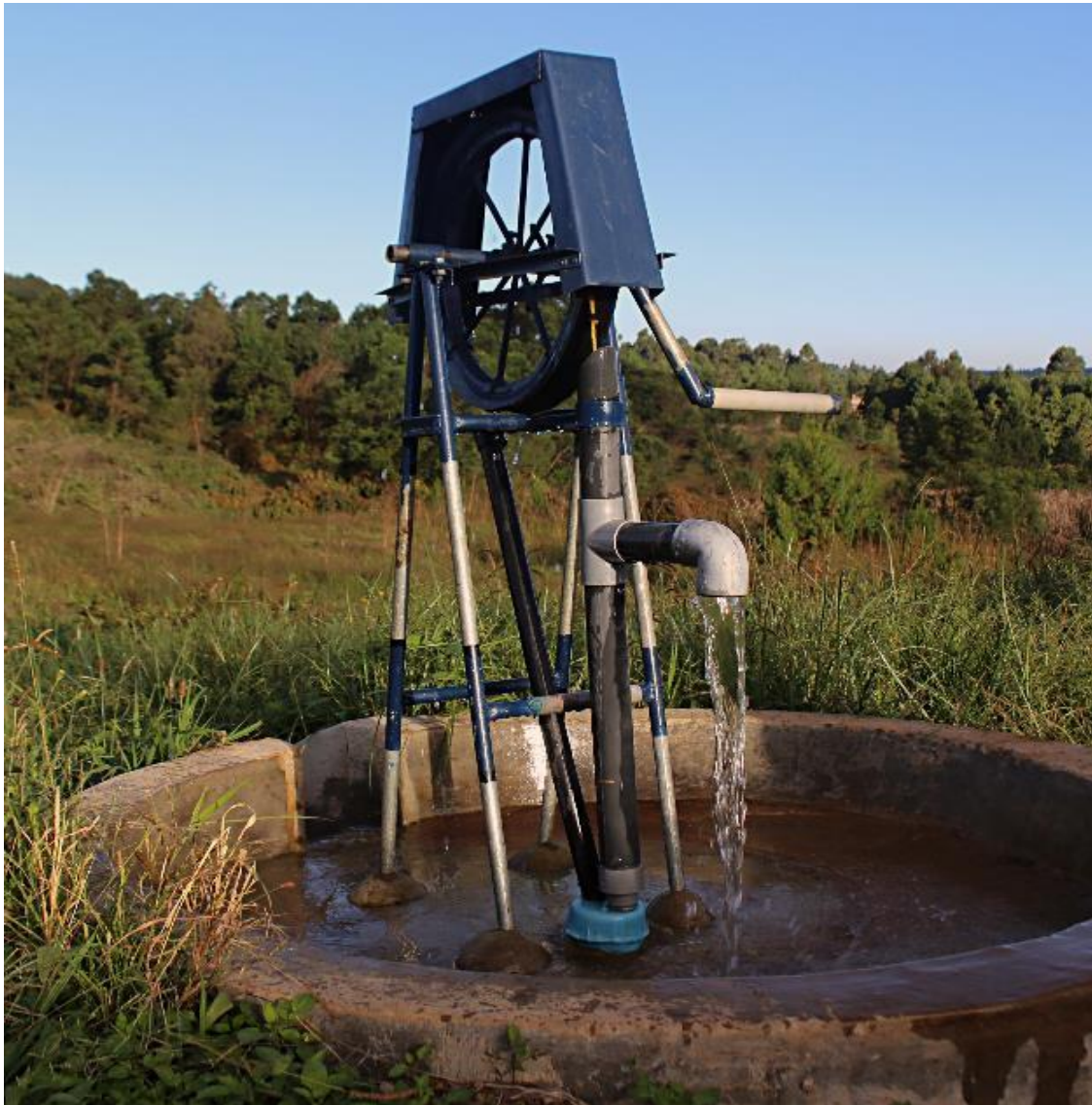
A Rope pump in Tanzania, the SHIPO model