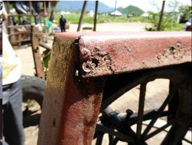
Bad quality well covers result in Corrosion